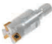
Twister 11 pag. F 54