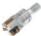
Twister 01 pag. F 50