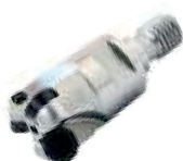
Twister 04 pag. F 52