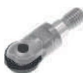
Twister 06 pag. F 53