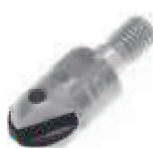
Twister 16 pag. F 55