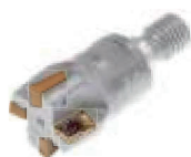
Twister 03 pag. F 51